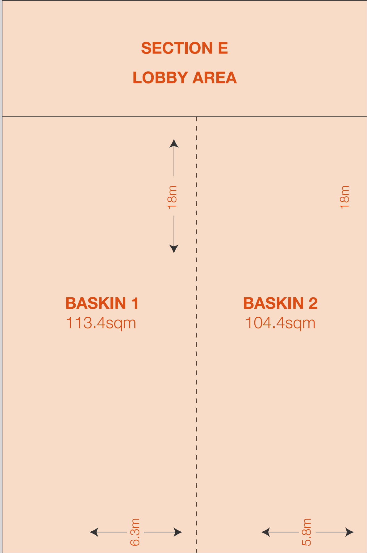
FULL BASKIN SUITE 241sqm – 18m x 13.4m